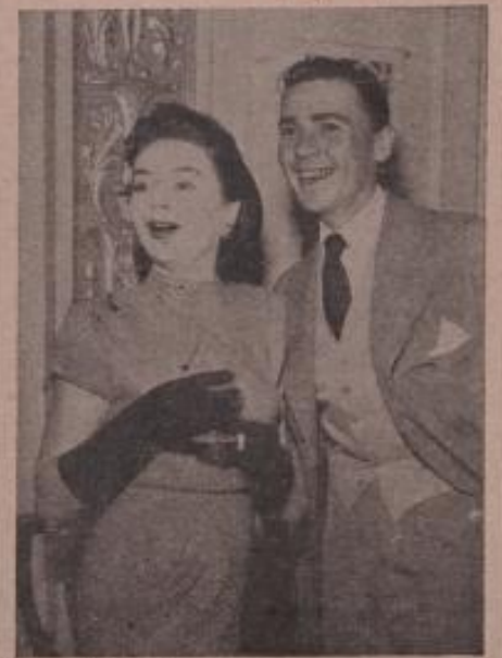
Seems like Bill Eythe's long distance romance with hit singer Margaret Whiting is over. Above, with steady date Buff Cobb.