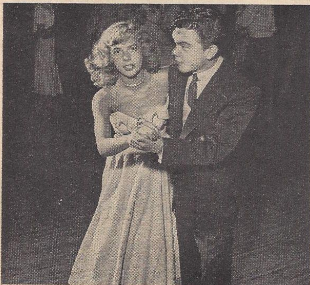
5. All that exercise calls for more. The Palladium's just the place. And you guessed it. They never missed a dance!